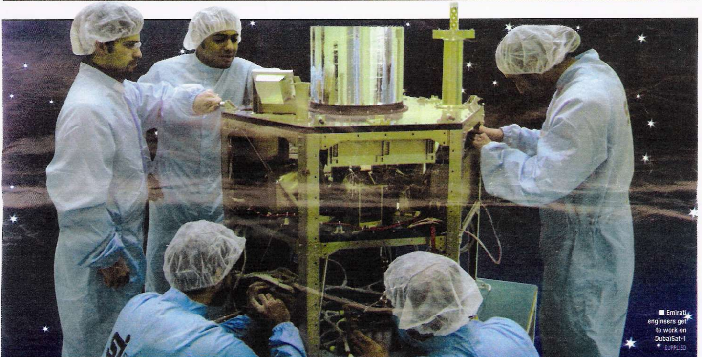
Emirati engineers get to work on DubaiSat-1